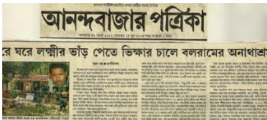
A copy of the report from Anandabazar Patrika